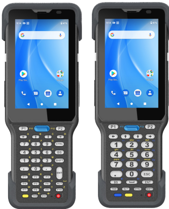
Function Numeric 38-key