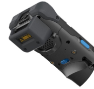
Long range version EX30 Near-Far imager 20m reading distance*.