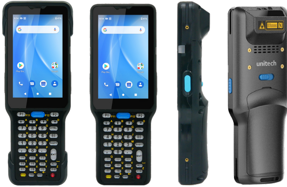
With bumper 2.4m drop-resistant