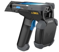
UHF/RIFD version with 2D imager.