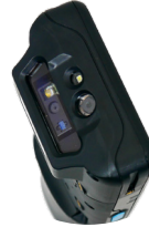
Standard version N6703 imager or N3603 imager, depending on key-configuration.